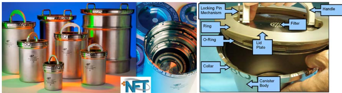
Figure 1. The SAVY-4000® Series and Primary Components