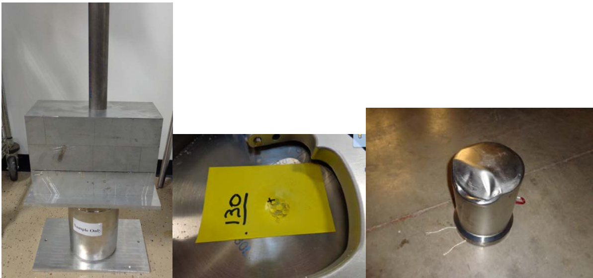
Figure 9. Results of the stacking, penetration and 30 Ft. drop tests