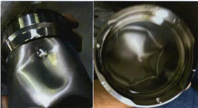
Figure 6. Damage caused by penetration bar test.

spray test after the penetration insults, and no water was found inside the container. Figures 7-9 illustrate the results of Type A liquid testing, including vibration, stacking, bar penetration and 30 ft drop tests, respectively. Because the filter allows liquid to escape the container, PVC tape was placed over the filter port. Under these conditions, all results were passing with the exception of the bar penetration test. A cap was developed for the SAVY-4000® to prevent the escape of liquid through the filter. The cap can also be used to create a hermetically sealed container for packaging content in inert environments and ensuring that oxygen cannot contact the material packaged inside. The hermetic cap is comprised of two 316L Stainless Steel components and a Viton® o-ring. The four threaded holes located on the outside of the filter act as the anchor points for the cap and the o-ring seal encompasses the rest of the diffusion holes in the lid, shown in figure 10.