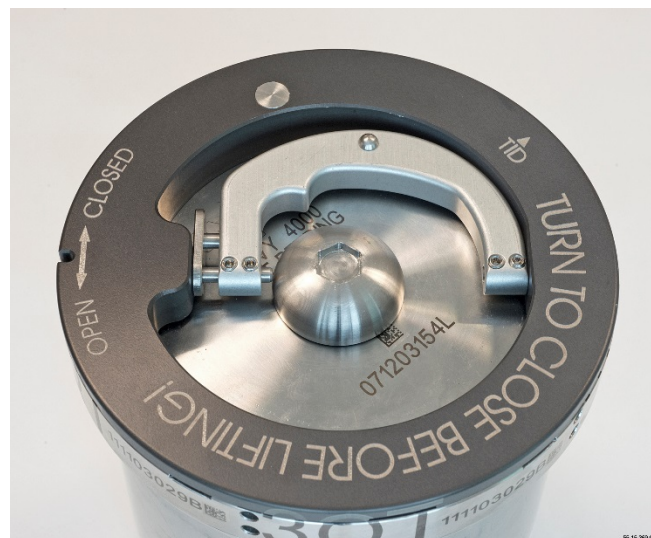
Figure 10. Hermetic Cap installed on a 3 Quart SAVY-4000®