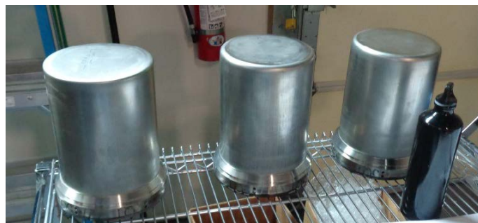
Figure 8. Post vibration test