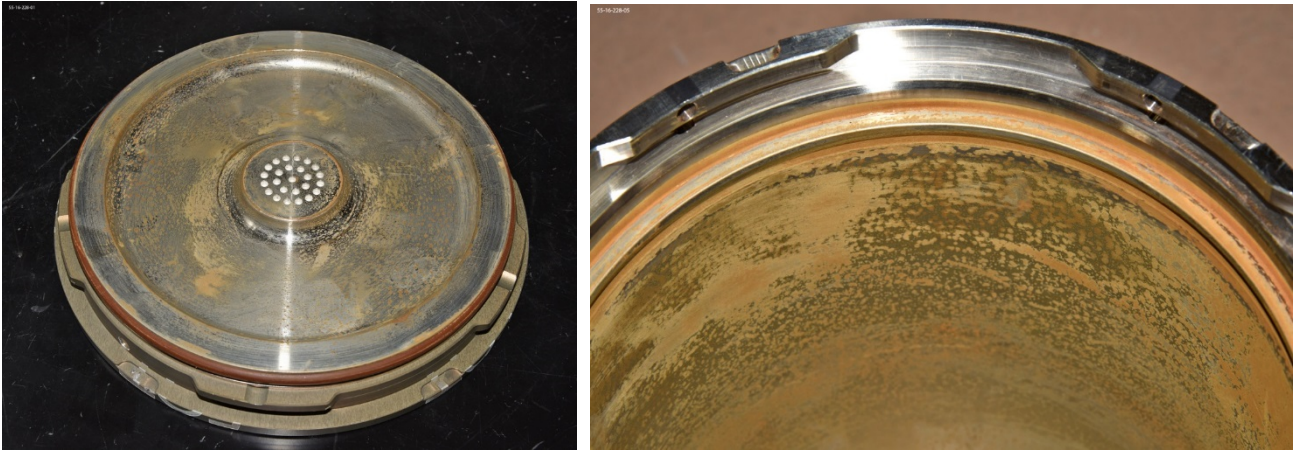
Figure 2. Item caught by M441.1-1 surveillance plan showing signs of surface corrosion.

life of five years to support design life extension. Items-of-opportunity containers will also be evaluated to provide additional data within the overall container population. The surveillance plan sampling is described in Table 3.