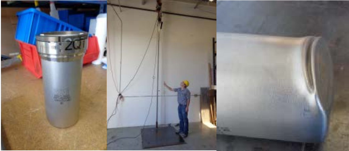
Figure 5. New 2 Qt. 12 ft. drop test and result.

apart or minimize the pieces being shipped. The two-quart container maintains the 12.1 cm diameter, but is elongated to around 20.3 cm in order to fit larger materials.